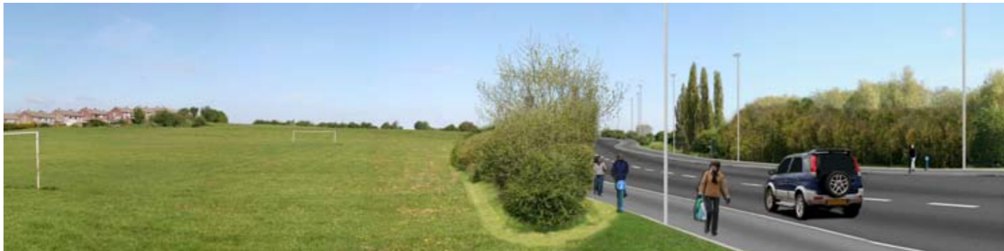
Artists impression of the link road looking north from the southern end of Woodhouse Mill Playing Fields